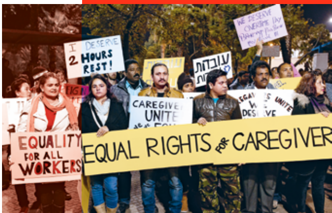
Tel Aviv: new forms of worker organisation – an opportunity for a new left politics? Social worker strike, Tel Aviv, 2011.

We help different left-wing actors share experiences and exchange strategies to better coordinate left-wing organising. To this end, we connect with social movements, unions and civil society organisations, as well as left-wing parties, governments and institutions.