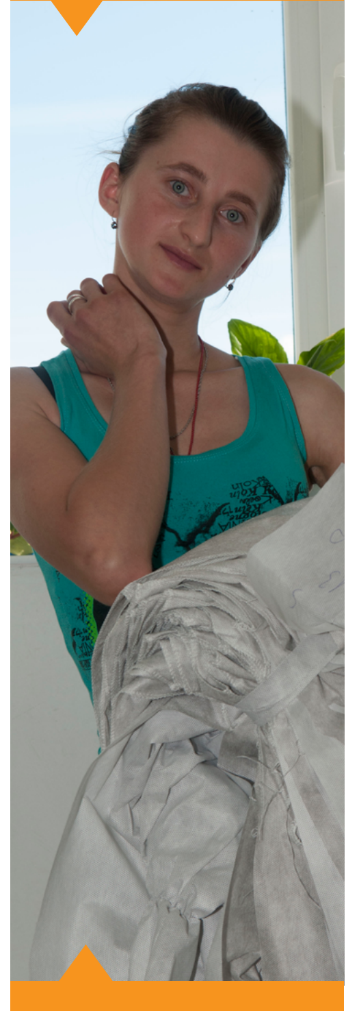
"The fleas are literally jumping from the newly arrived cloth – I had tens of bites in a single day."

"All our complaints are answered with one sentence: 'The gate is over there.'"