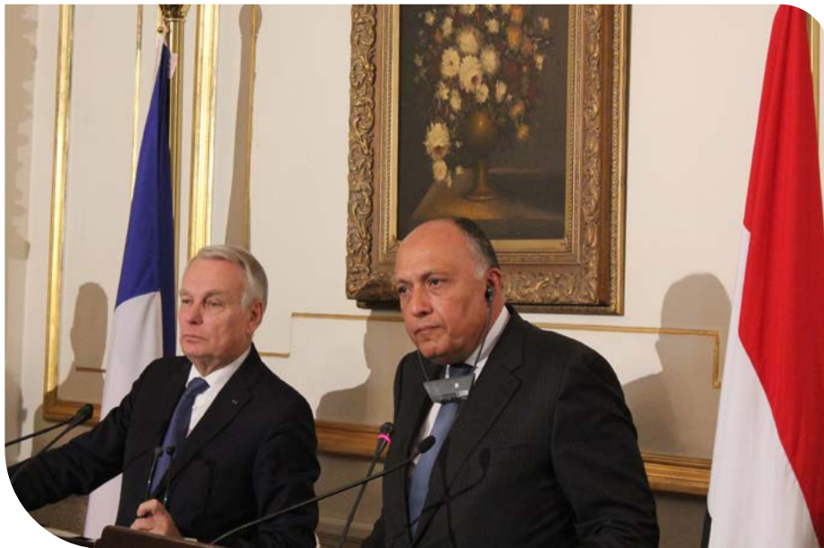
French and Egyptian Ministers of Foreign Affairs Jean-Marc Ayrault and Sameh Shoukry during a press conference in Downtown Cairo 2016

Meanwhile, the lack of transparency surrounding the asylum law's drafting process is worrying, as this potentially far-reaching legislation could pave the way for Egypt's government to further undermine international refugee law. The UN refugee agency itself plays, at the same time, an ambivalent role in Egypt. By actively supporting the asylum law, it sidelines itself and transfers responsibility to the Egyptian state, which appears to not take the Geneva Convention seriously. Efforts to put Egypt under more effective pressure for violations of the convention will be, thereby, further thwarted.