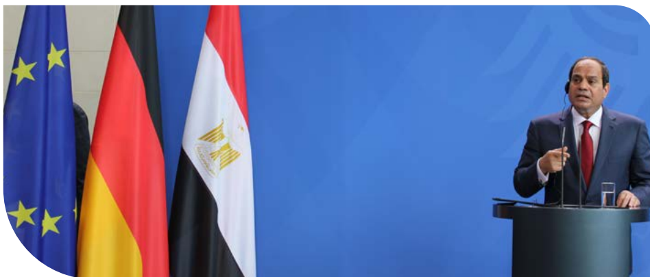
President Abdel Fattah Al-Sisi during a press conference in Berlin in 2015

Immediately after the devastating 2016 shipwreck off the coast of the Mediterranean city of Rashid, 4 in which more than 300 people are believed to have drowned, the regime closed maritime borders. Ever since, almost no boat has, within the scope of irregular migration, set sail from the country's coast towards Europe. Already at that time, the 2016 EU-Turkey deal served as a blueprint for Egypt's President Abdel Fattah al-Sisi to define Cairo's future approach towards Europe. The regime's goals in striking a similar deal are obvious: preventing criticism of human rights violations; and to be redeemed on the international stage after Sisi's bloody 2013 takeover. 5