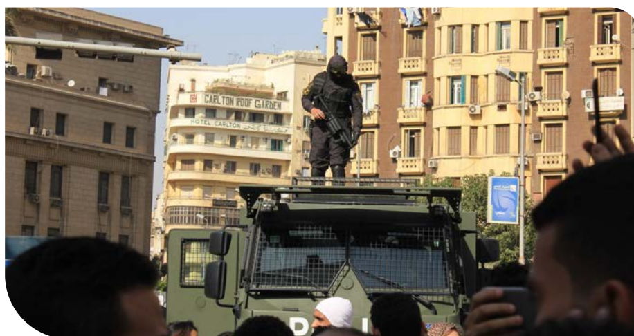
Egyptian riot police during a protest in Downtown Cairo in 2016

Meanwhile, detained refugees and people on the move are mostly placed in different cells and are not kept together anymore—in contrast to prisons like al-Qanater where special cells for foreigners are still in use. In the past, relatives or employees of charity organizations often had easy access to detention centres and could distribute food and medication. Today, however, this is only possible to a limited extent.