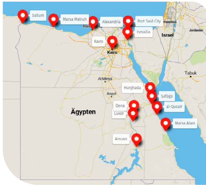
Egypt, Source: OpenStreetMaps/Umap, Sofian Philip Naceur 2022