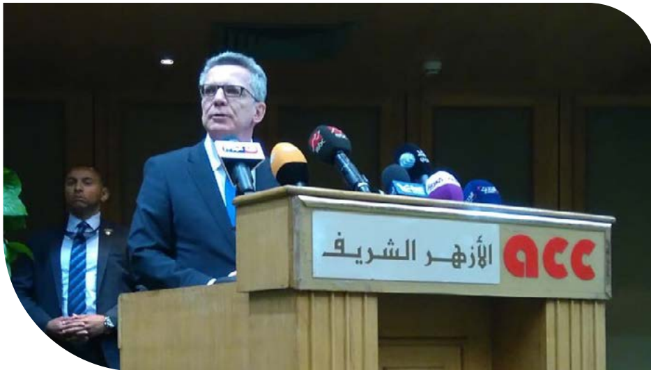
Germany's Minister of Interior Thomas de Maizière during his visit in Cairo 2016

as jets and warships, while Italy 9 and Germany 10 have significantly intensified their bilateral development aid and police cooperation with Cairo.