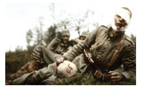
Apocalypse Episode 2: May 1915. The German soldier has been hit in the face by shrapnel

In the second episode of Apocalypse , the French army stops the German advance at the battle of the Marne, while the Germans halt the Russians at Tannenberg on the Eastern Front. In France, the warring parties dig themselves in for four years in the trenches. Soldiers from the colonies come and lend a hand to their colonisers and the war becomes global.