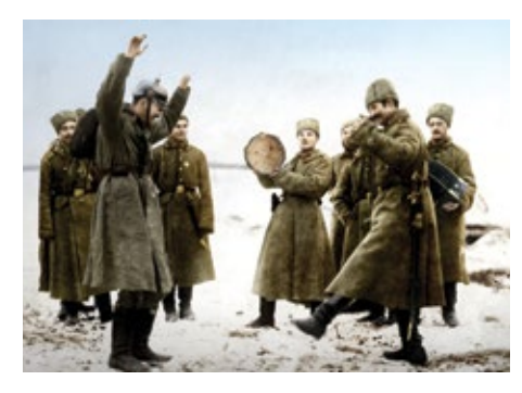
Apocalypse Episode 2: Russian and German soldiers have fun and dance together