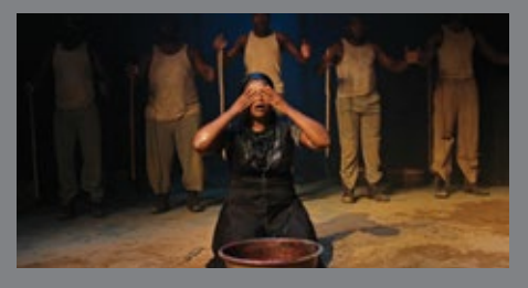
Still from The sinking of the Mend

On the foggy morning of 21 February 1917, 600 men, mainly from rural Pondoland in the Eastern Cape, lost their lives when the troopship SS Mendi sank in a shipping accident just off the Isle of Wight. The men were on their way to support the British Army in France during World War I.