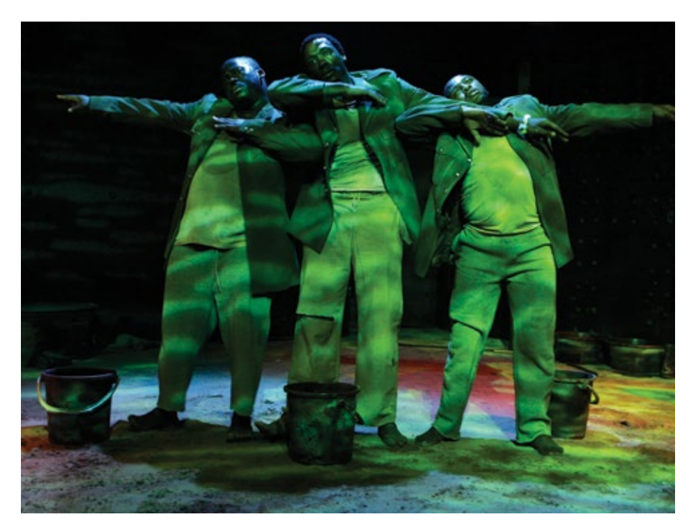
Still from Ukutshona ko Mendi... Did We Dance (The Sinking of the Mendi,

WISER, UNIVERSITY OF THE WITWATERSRAND, BRAAMFONTEIN, JOHANNESBURG