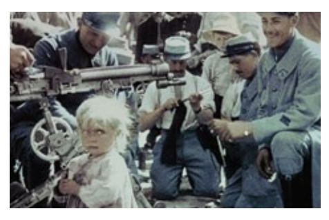
Still from Apocalypse Episode 1: No fear next to the terrible Hotchkiss machine gur

The French Institute of South Africa brings South Africans this absorbing documentary series on five consecutive