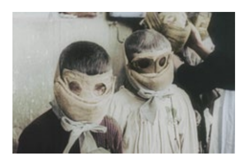
Still from Apocalypse Episode 3

Episode three of Apocalypse opens in 1916. The war is raging in Europe and